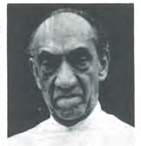
butcher of Tamils, Jayewardene

It is a categorical statement in the proposals that state-owned industries will not be transferred to Provincial Councils. The granting of power to the Provincial Council 'establish' and promote industries within their own areas means nothing as the Councils have to depend for all finance on the Central Government. On the one hand,