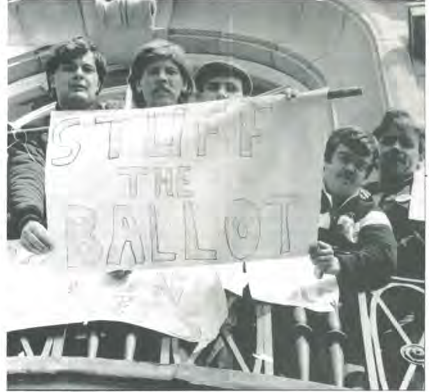
a message for Kinnock and the TUC

At the Labour Party Conference the whole of the Kinnock/Willis document must be thrown out, Rights, responsibilities, freedom, fairness - like all the other meaningless rhymes that bubble out of Kinnock's mouth - cover-up a well prepared kick in the teeth for the working class.