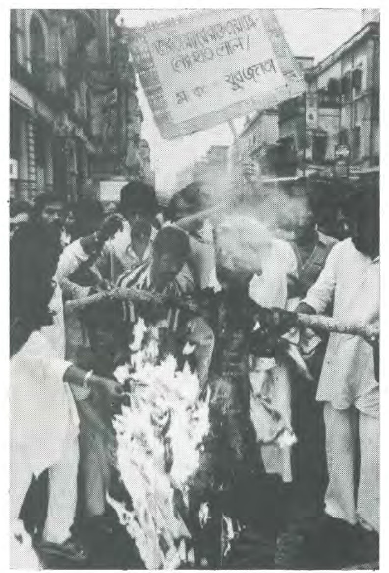
Tamils burn efigy of Jayewardene