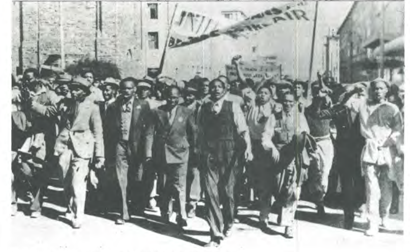
South African black workers in the 1930's - their crisis of leadership is still unresolved