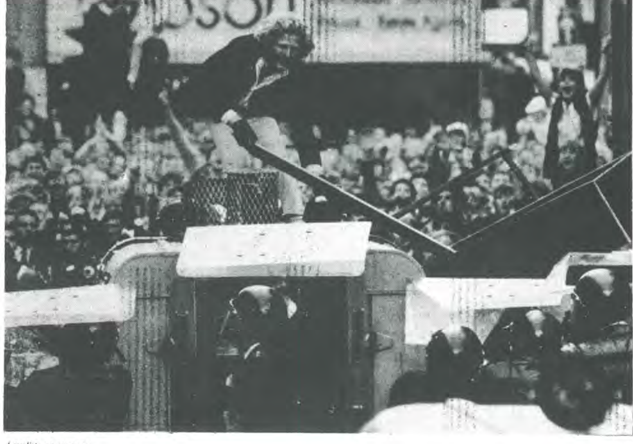
Loyalists on rampage